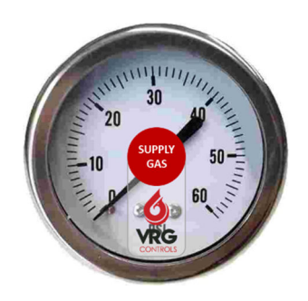
CBM Center Back Mount Gage - 2.5 in DIA

Dampening: Internally Dampened Temperature: -40° F to +180° F